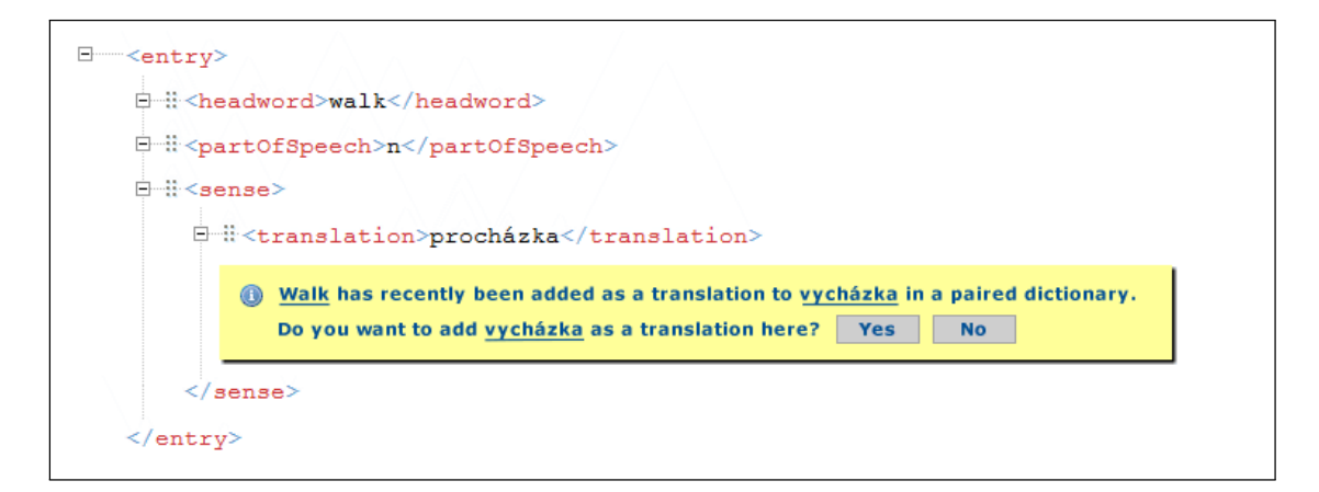
Fig. 2: Keeping paired dictionaries synchronized semi-automatically: "'Walk' has recently been added as a translation to 'vycházka' in a paired dictionary. Do you want to add 'vycházka' as a translation here? Yes – No."

This way the lexicographers will be encouraged to keep the two dictionaries synchronized.